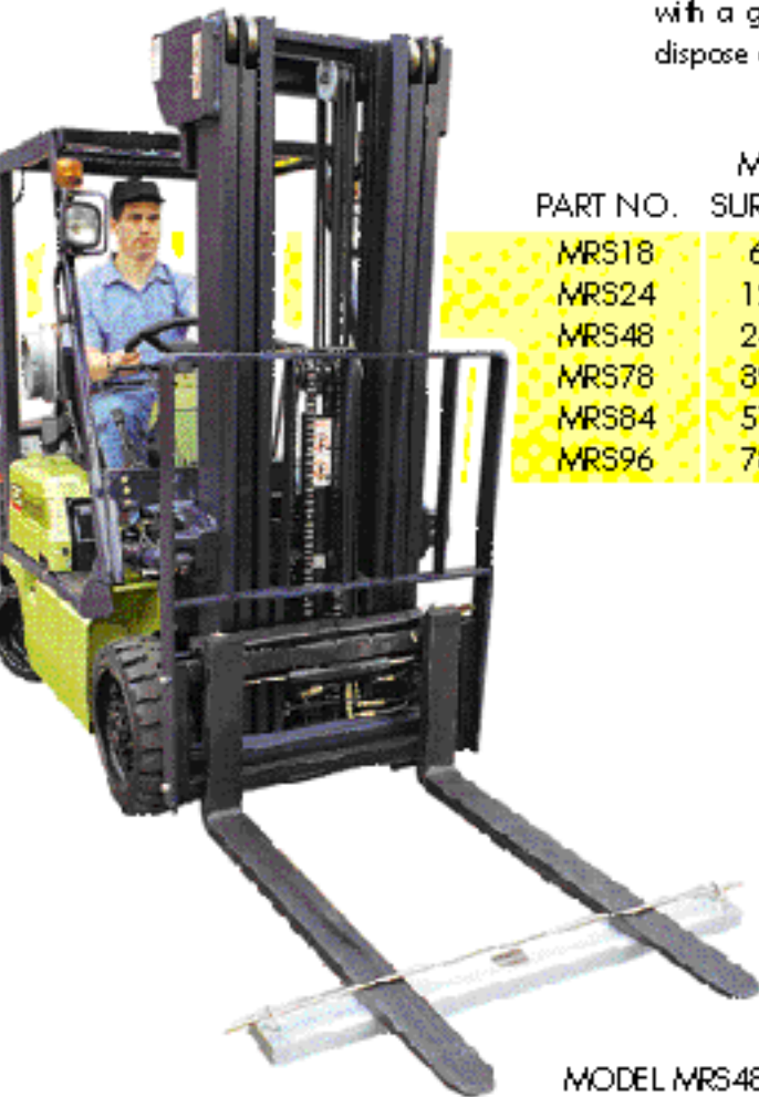
MODEL MRS48 (Hanging bar not included)

Maximum recommended operating speed: 5 mph. Recommended sweeping height: 2" - 4"