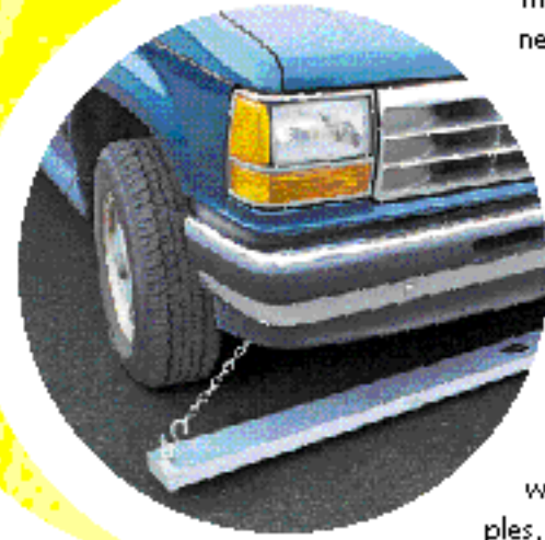
MODEL MRS78 (Chain and Shocks not included)

These are superpowered, permanent magnets for the removal of sharp iron objects from roads, parking areas, loading docks, runways and other important traffic areas.